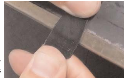
FORM STOVE CLIP AROUND STOVE TOP EDGE

7. Use light pressure to form Stove Top Edge Clip into a hooked shape that will grab the front edge of the stove top. Forming bend will be easiest along areas where material has been removed. Do not bend repeatedly as this may wear material and cause it to weaken or break, (See Figures I and J).