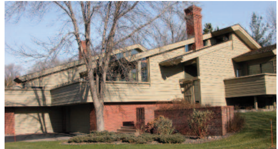
Eastbank Condominiums, North Hudson, WI

The solution: Tjernlund's Dryer Duct Booster® was installed to maintain proper exhaust velocity which significantly reduced drying times, energy consumption and minimized lint build up.