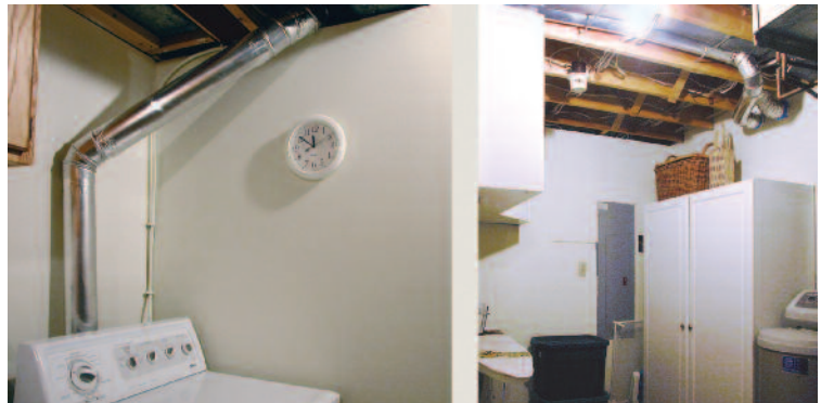
Interior clothes dryer duct runs included many elbows and an excessive linear duct length