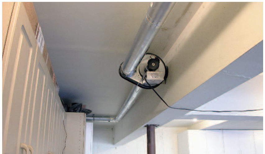
Exterior duct run with Dryer Duct Booster® installed in the garage. Duct was changed out from corrugated aluminum flex duct to rigid metal duct.